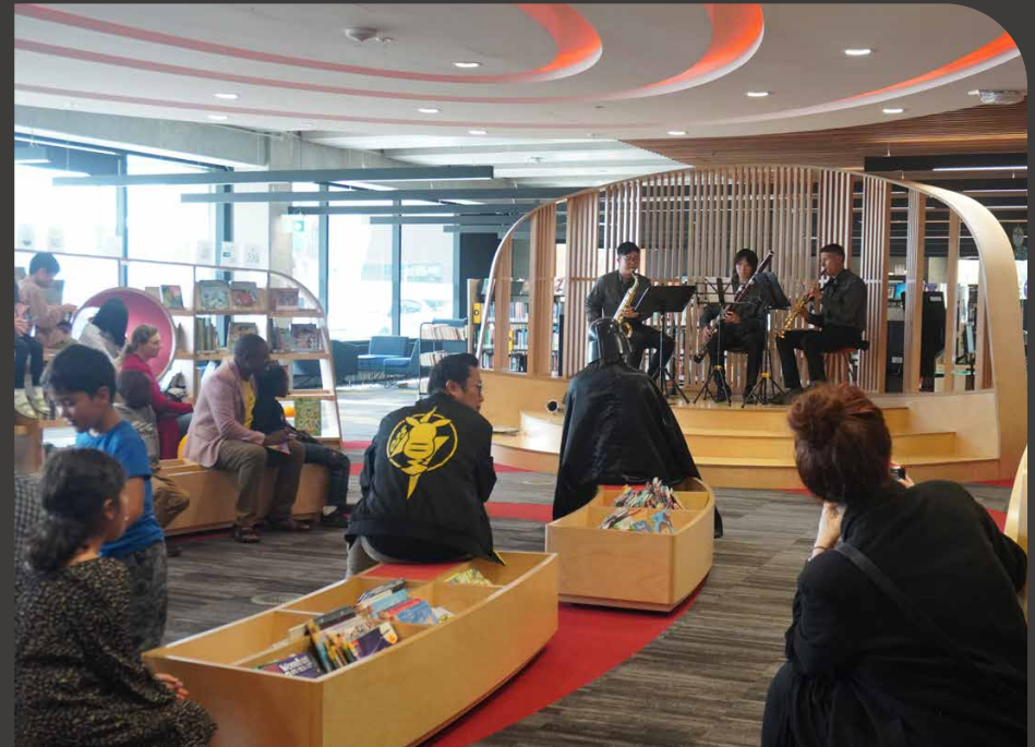
A surprise visit from Darth Vader amused audience and staff alike.