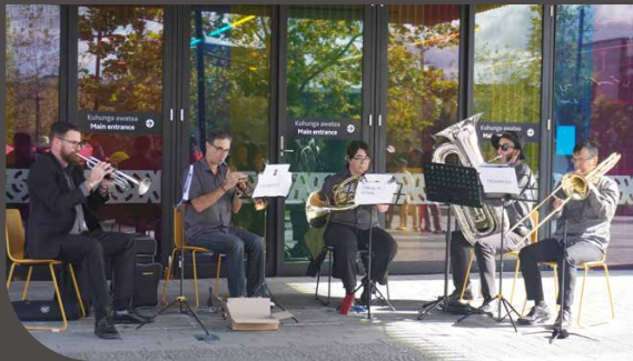
A brass quintet welcomed the library-goers

Our presence and visibility in the community was greatly impacted by this event. Children and adults were exposed to new instruments and music styles, had the opportunity to ask questions and get up close and were generally inspired by our musicians.