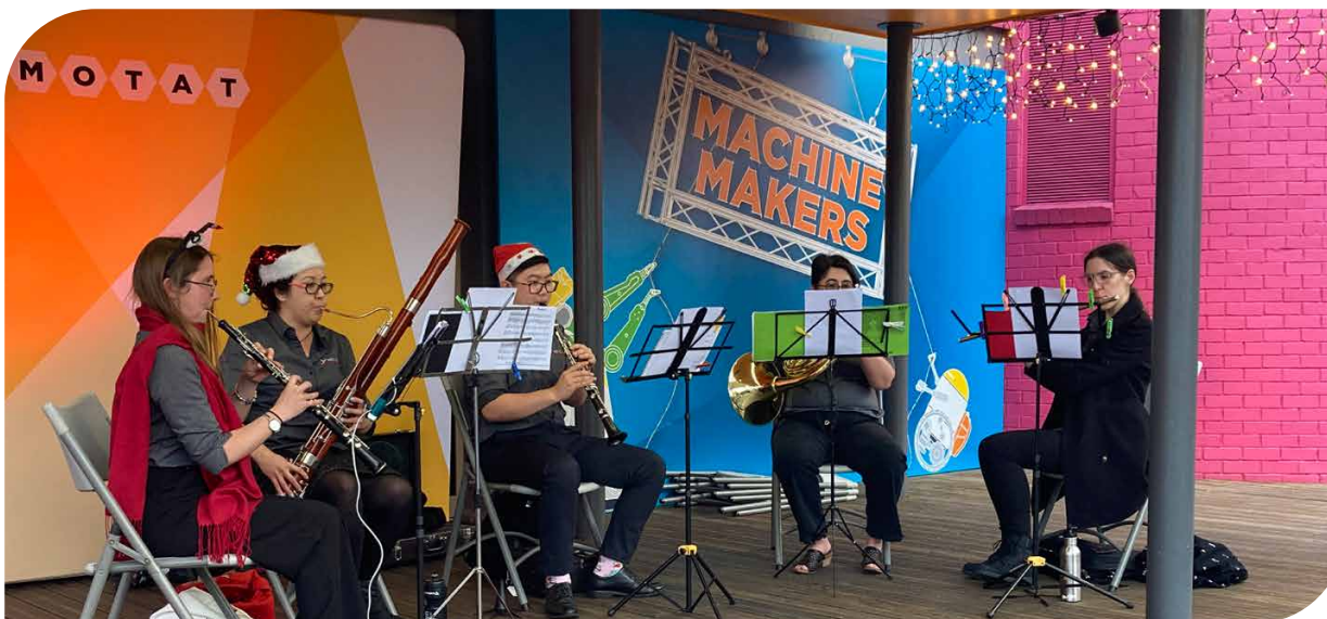
Around twenty-four West City Music small ensembles provided about 48 hours of live music at the MOTAT Christmas Lights event (Dec '23)