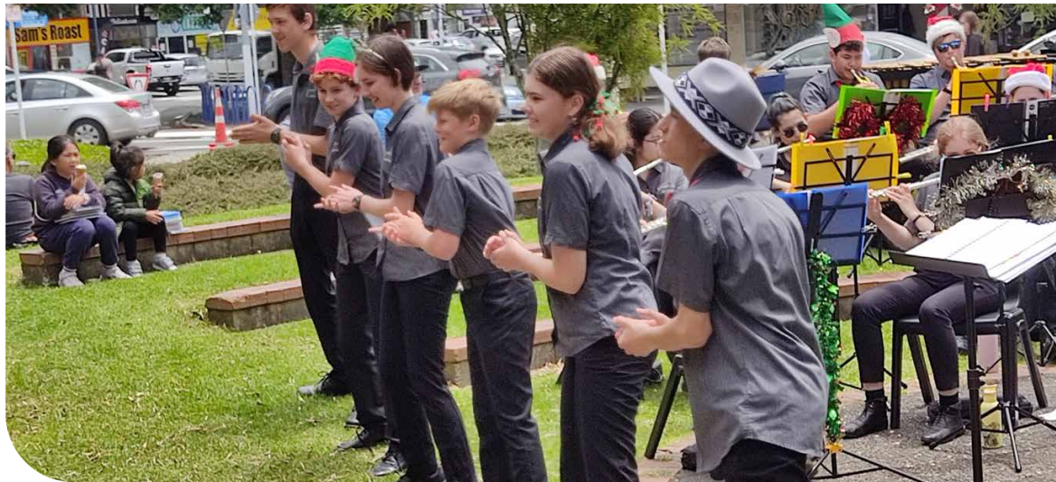
The West City Youth Concert Band entertain the crowd at the Te Atatu Christmas Parade (Dec '23)