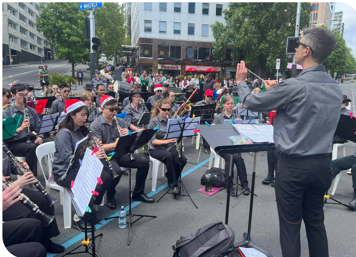
West City Concert Band performs on Queen Street for the Farmers Santa Parade (Dec '23)

WCCB provides several free performances to the public including the Farmers Santa Parade (Aotea Square, Queens St), and returned to the ANZAC